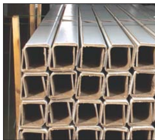
U-channel does not nest; requires four times more shipping space than ChannelLock.