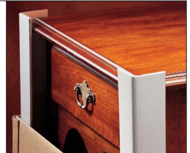
The coating gently cushions, grips and guards against surface damage during shipping, handling and storage.

ScuffShield takes the protective strength of VBoard® and adds an abrasion-resistant coating to protect delicate finishes from scuffing and scratches that can occur in shipping and handling. ScuffShield is the perfect edge protector for furniture and appliances. The interior legs of ScuffShield have a special abrasion-resistant coating that seals off the rough fibers of the paperboard, leaving a smooth surface against the product. The ScuffShield coating also can be applied to other Laminations product offerings.